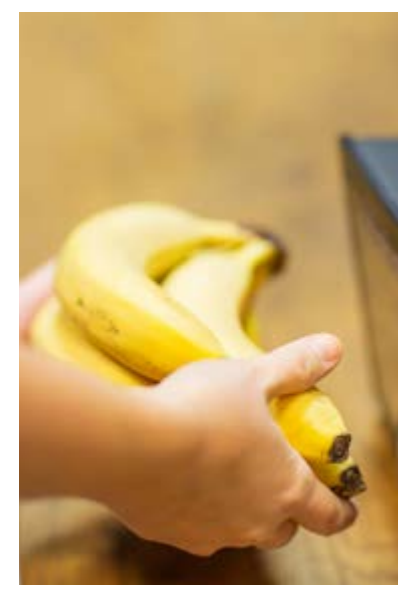
We aim to provide access to sustainable employment opportunities in a diverse range of sectors